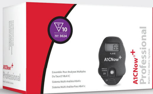
A1CNow ® + system (10-count test kit) 3024

Informed conversations at the point of care